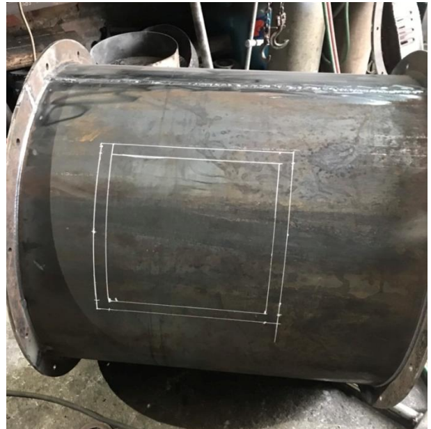
Fabrications were carried out in workshop as per dimension taken