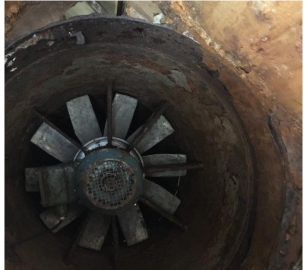
SMT Carried out inspection on 21 January 2020 on board to take all dimensions for workshop fabrication.